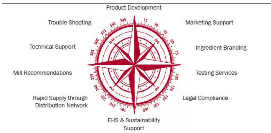
Figure 1: 360° Service Offering of the HeiQ